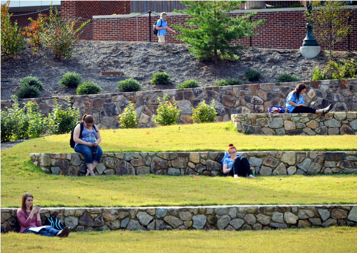
Falling back Students enjoy a warm fall afternoon on the amphitheater near the Genome Sciences building on the campus of the University of North Carolina at Chapel Hill.